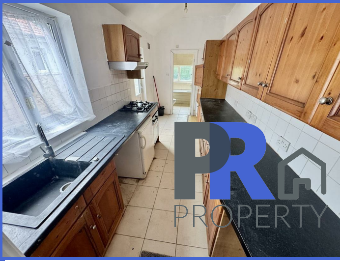
66 Butlin road, Luton, LU1 1LD Asking price £220,000